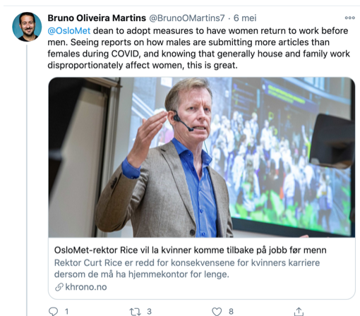
@CurtRice OsloMet Norwegian News